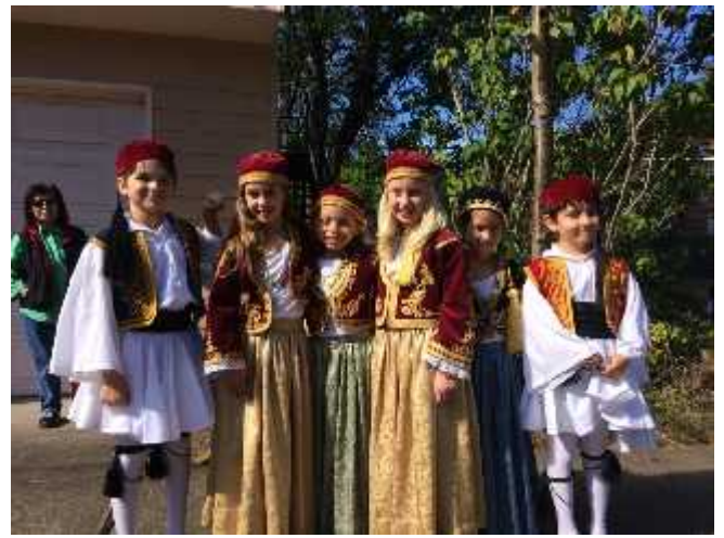
Hara Dancers at Festival! (Above)