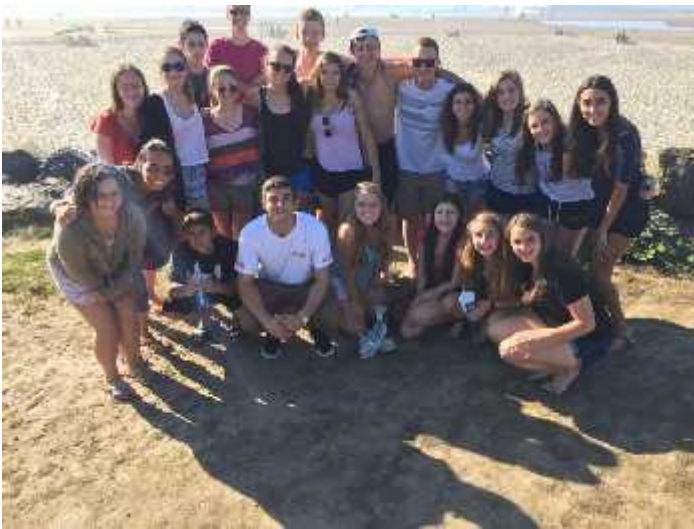
Goyans on a beach trip to Tillamook (Above/Below)