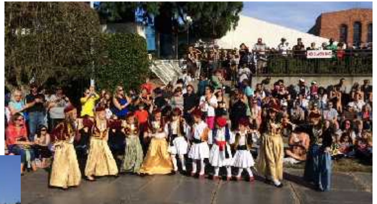
Paradosi dancers at Festival! (Above and below)