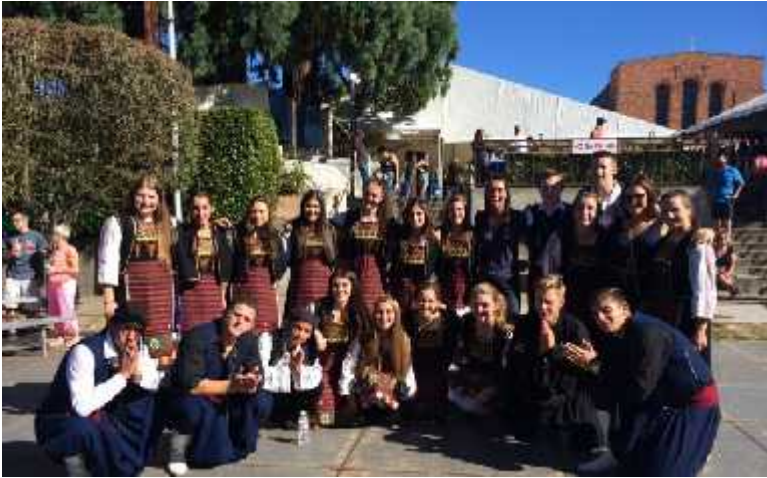
Anatoli Dance Group (Above)